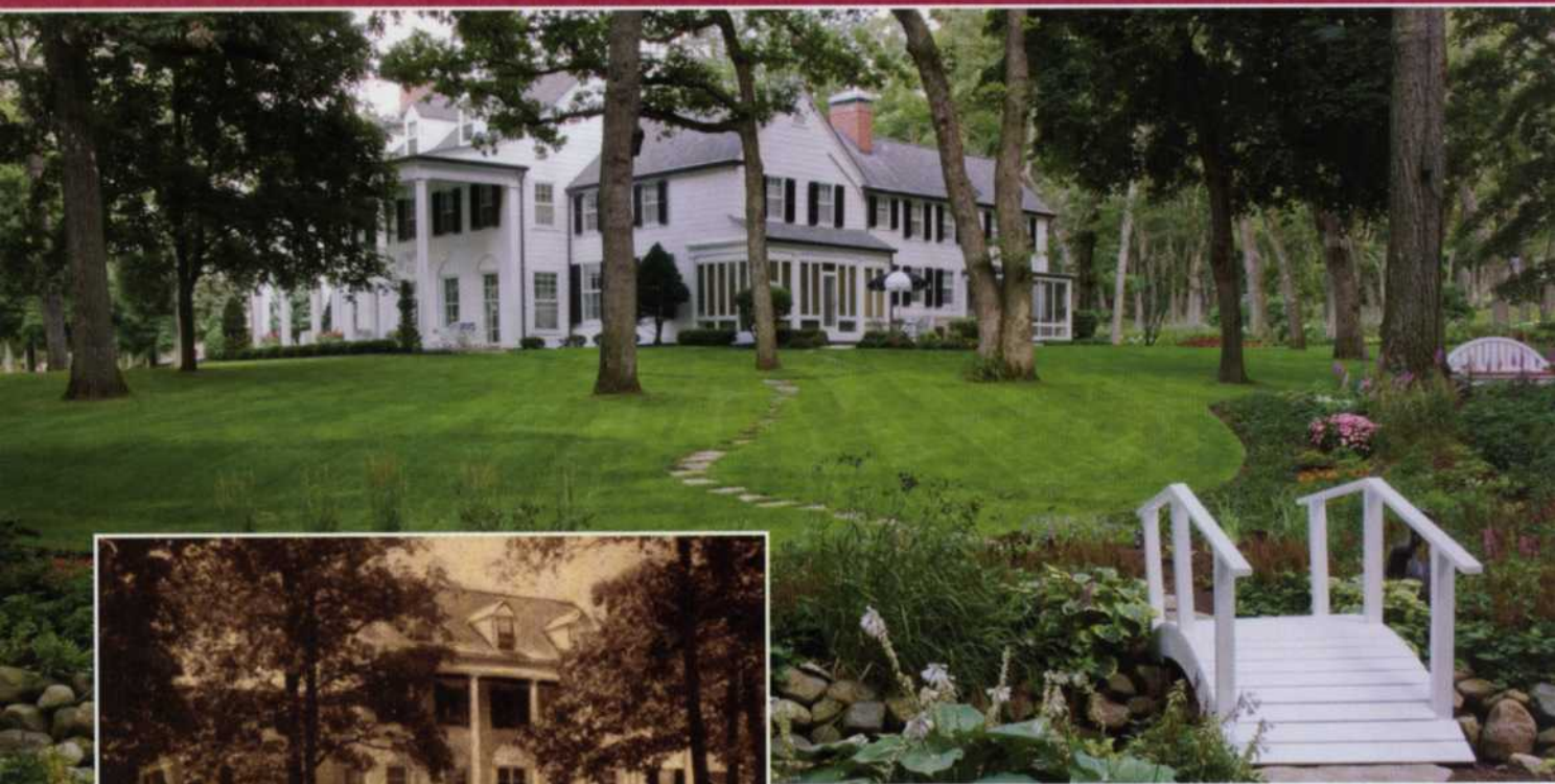
Most of the old trees and expansive lawn remain. Boxwoods, raised beds of colorful annuals and perennials, and footpaths add charm and a sense of enduring beauty to the landscape.